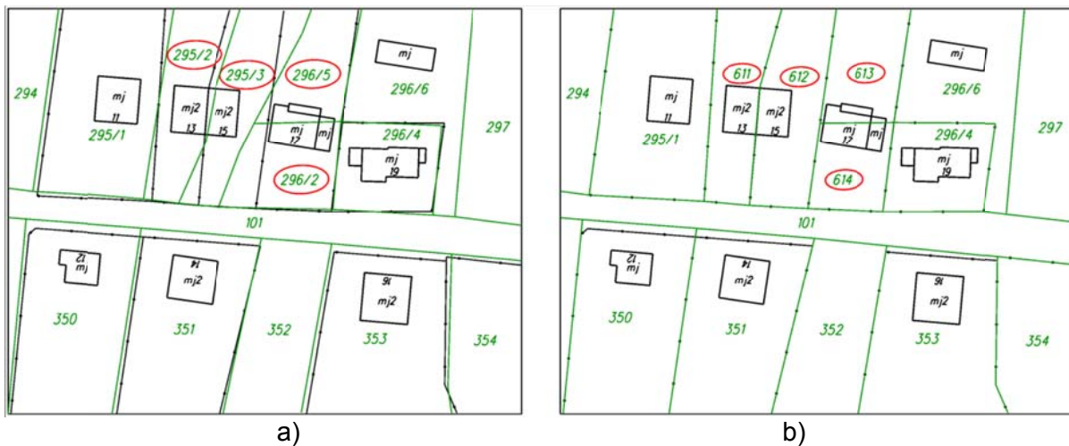
Fig.2. Part of cadastral map created on the basis of the map in the scale 1:2000, a) before modernization, b) after modernization

Fig. 2 shows a methodology based on the modernization of the map in the scale 1: 2000 created on the basis of a photomap. Determination of the course of borders for parcels No. 350, 351, 352, 353, was performed according to a calm state of use, which does not raise methodological and formal-legal objections. But problematic seems to be the determination of the borders of the parcels No. 295/2, 295/3, 296/5 i 296/2. Determination of the course of borders in this situation, according to the state